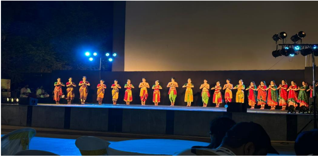
Figure 1 Kalakshetra Foundation presenting a cultural event in IIT Chennai