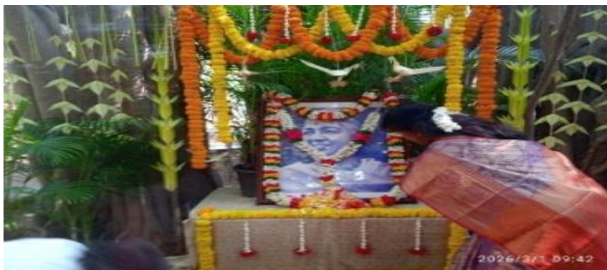
Figure 4 Celebrating the birthday of Smt Rukmini Devi Arundale