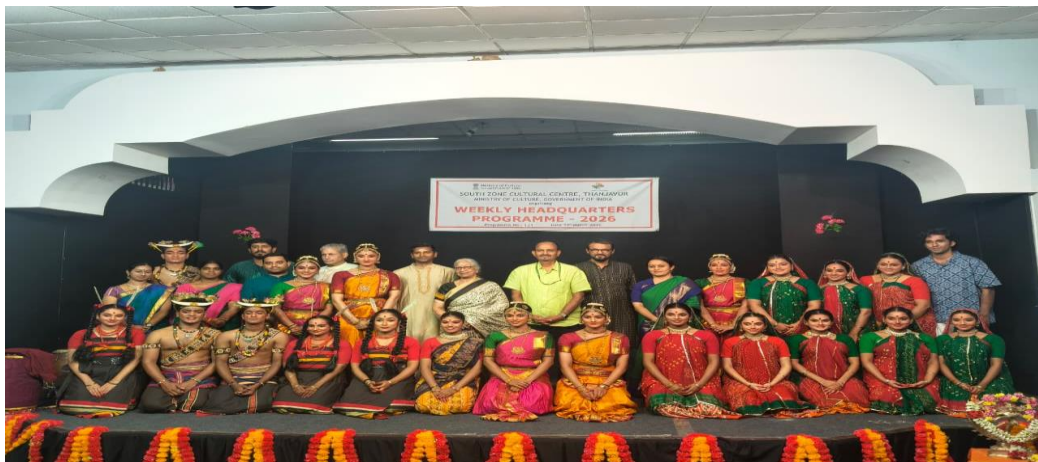
Figure 2 Kalakshetra Performing for South Zone Cultural Centre, Thanjavur