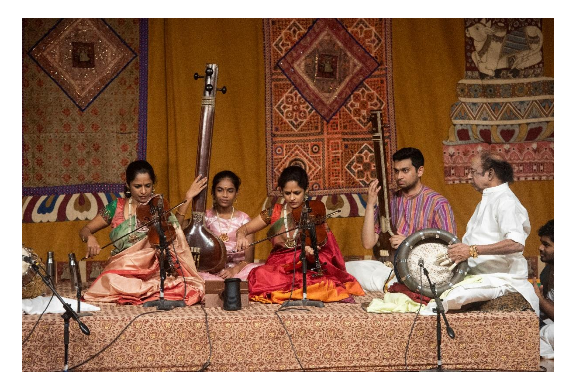
7:00–9:00 PM: Violin Concert by Akkarai Subbalakshmi Sisters